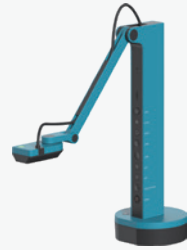
VZ-X Wireless Document Camera

IPEVO's solutions offer a remedy for the issue of teacher shortages. By integrating document cameras and the TOTEM series and VOCAL with a portable, simple setup, district-wide remote classes achieve clear video quality, providing an immersive learning experience.