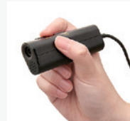
P2V ULTRA Object Camera

Experience P2V ULTRA handheld and multi-camera modes. Paired with IPEVO Visualizer for enhanced teaching demonstrations in the classroom and clear content sharing with remote learners.