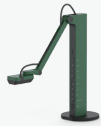
VZ-R Dual Mode Document Camera