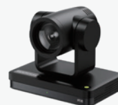
VC-Z4K UHD PTZ Camera

Enables clear capture of speakers using remote-controlled camera adjustment or AI automatic tracking.